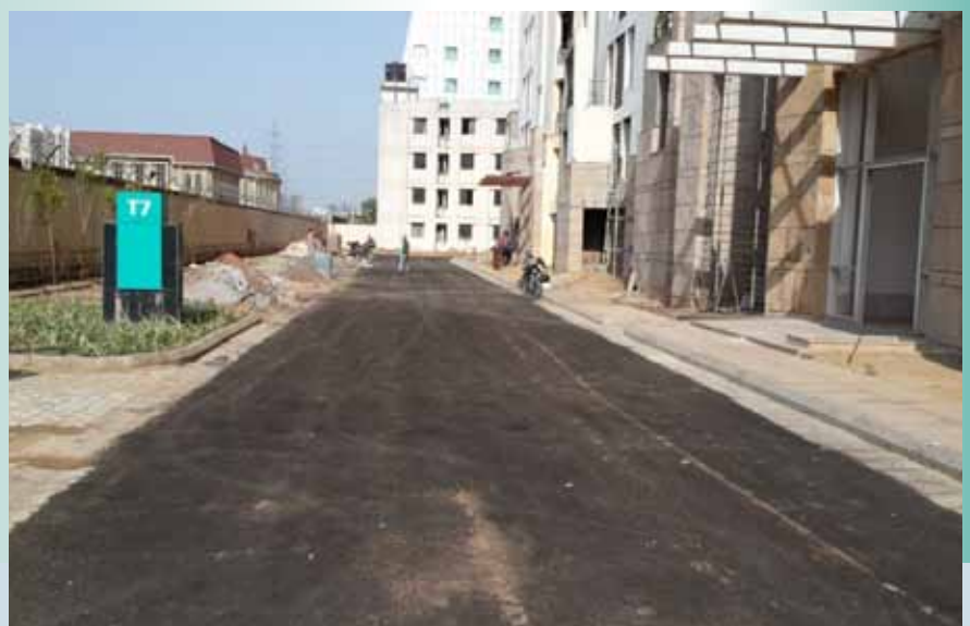
Internal Roads Road in front of Tower 6-8