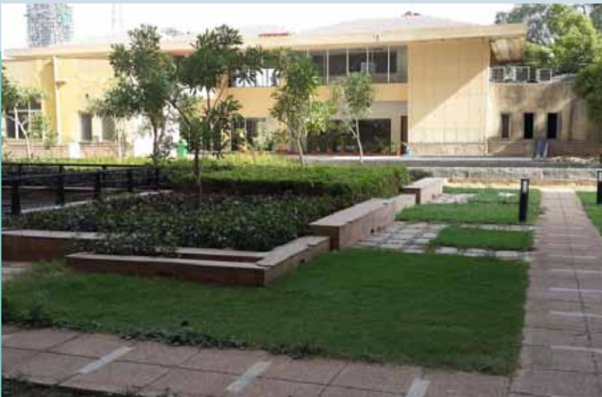
Landscape View of the landscape between Tower 6 & 7

We would like to keep you up to date with what's happening in and around your privileged Unitech property.