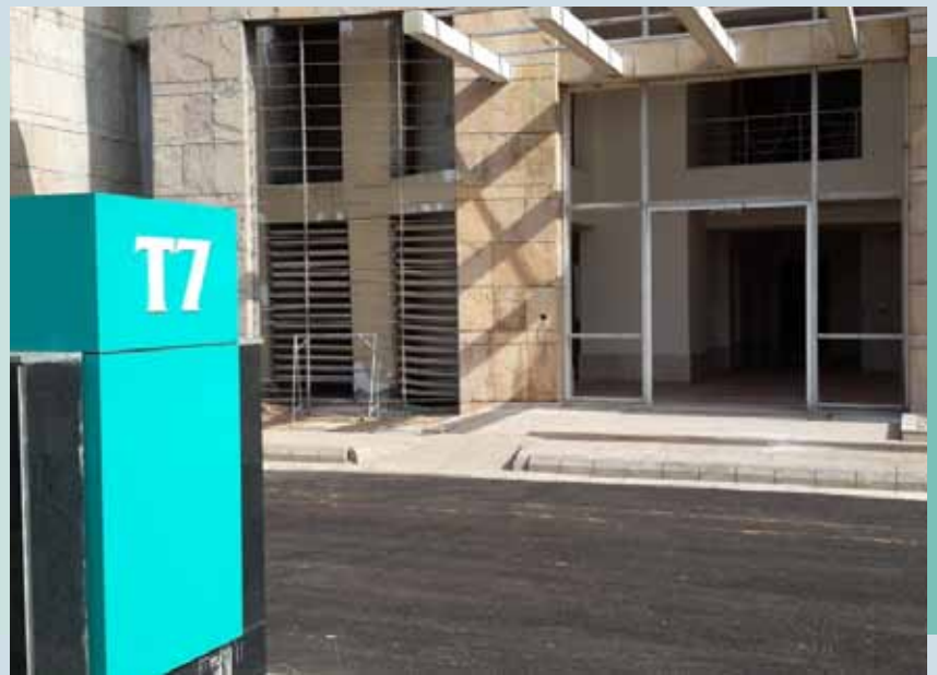
Tower 7 Signage installed in front of Tower 7