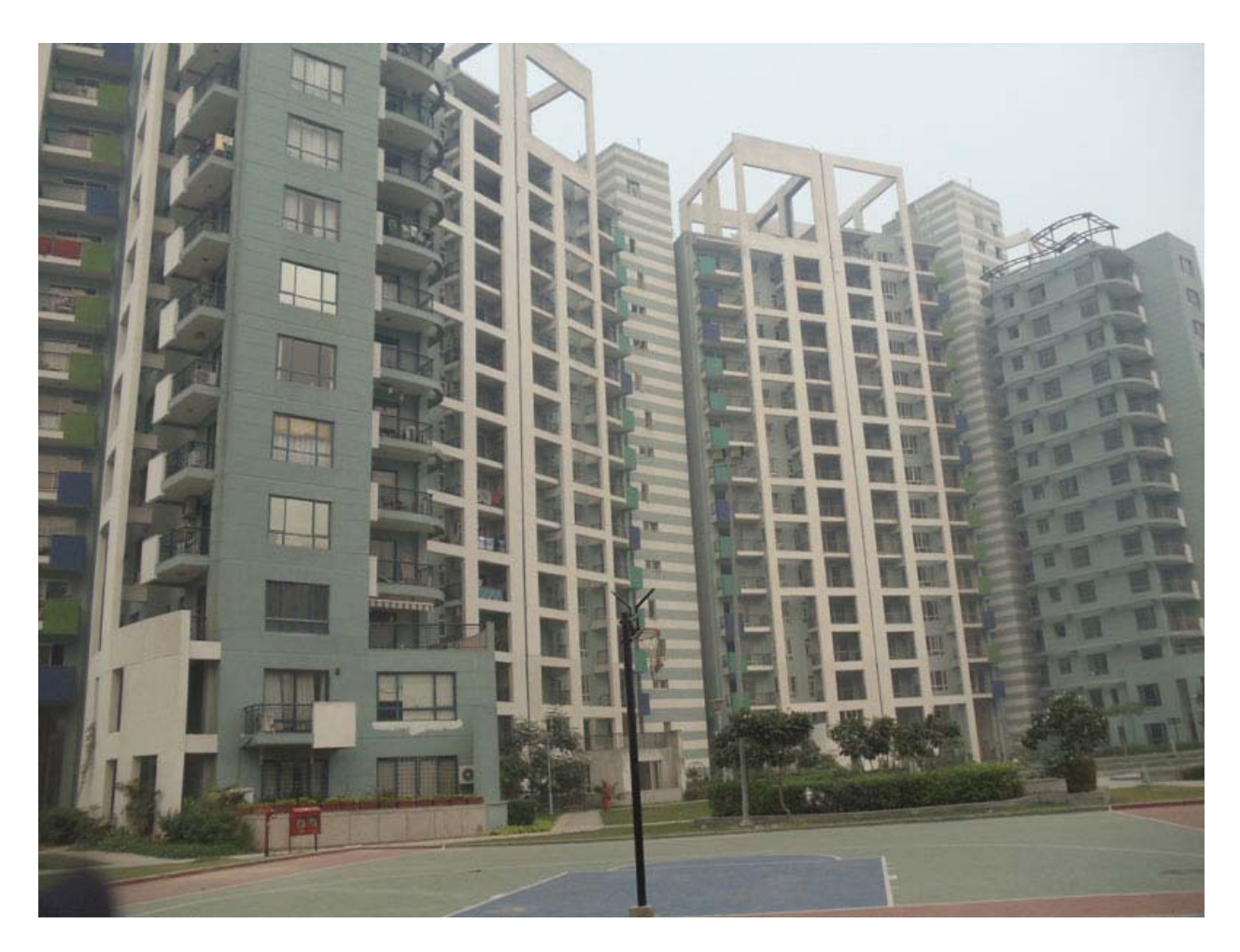
Tower 9, 10, 11 - Tower 10, 11 advance stage of completion