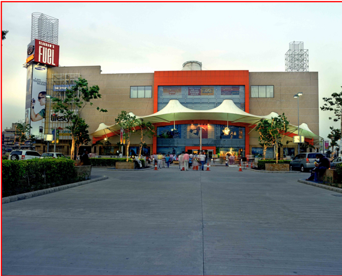
Great India Place, Noida