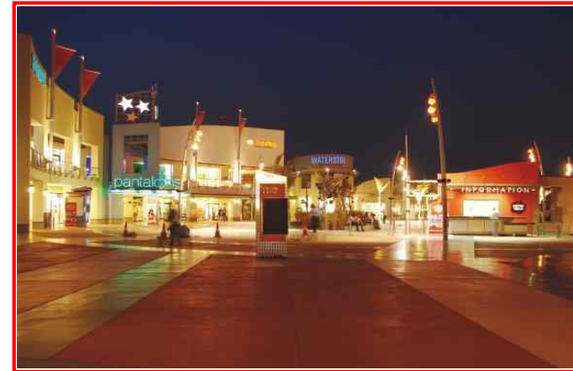
Gurgaon Central, Gurgaon